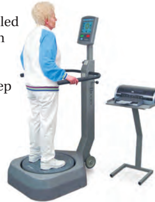
Biodex Balance System

Normal balance is controlled by a complex combination of visual, muscular and neurologic systems. Together, these factors keep us from falling when we encounter an unexpected disturbance. Testing and appropriate exercise will improve an individual's ability to remain upright under challenging conditions.