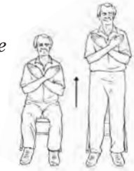
Chair Stand Test

Strength is a critical factor for a rapid response to a balance disturbance. Testing will identify weakness and, if necessary, exercise will significantly improve lower body strength.